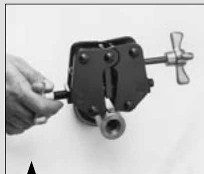
BETEX KZZ Patented key-drawer

Use of shaft protectors prevent distortion to the shaft centers and the screw.