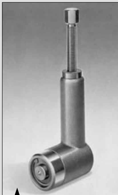
BETEX no. 44 Hydraulic 8/15 tons mini-press

When using mechanical screws, much of the force is lost as a result of the friction caused by the thread. This minipress administers a shock to the part which is to be extracted. This enables optimal use to be made of BETEX pullers no. 48, 52 and 54, without loss of force or wear and tear to screws. Note: may be used from 49-200, 52-230 and 54-300 and upwards.