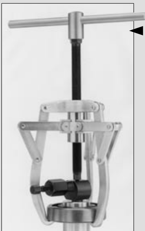
BETEX no. 50 T-handle wrench for universal applications

These T-wrenches with internal hexagon spare your pulling tools. This model has the following advantages: