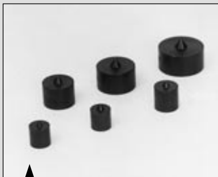
BETEX no. 625/630 Shaft protector sets for shaft centers and hollow shafts

These shaft protectors are indispensable between shaft and bearing-puller while dismantling bearings, couplings etc. There are two types: no. 625 for protecting shaft centers and no. 630 for hollow shafts.