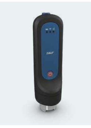
SKF QuickCollect Sensor

SKF ProCollect provides on the spot analysis and indications of machine problems and severity, enabling the planning of proactive maintenance and corrective actions.