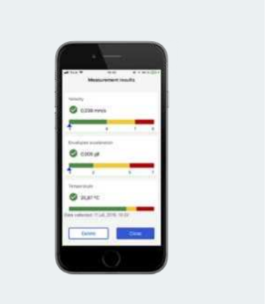
SKF ProCollect app available for both iOS/Android smart devices.

manual lubrication routes, then share inspection, process and machine health data. Either company-wide, or by tapping directly into SKF's remote diagnostic centres for expert analysis and advice. With entry-level setup costs and easily understood technology, this is a solution that you can buy and scale within your budget. This makes SKF Enlight ProCollect the perfect machine maintenance setup for a wide range of competencies and industries, and a cost-efficient way to digitalize the monitoring and maintenance and take one step into Industry 4.0.